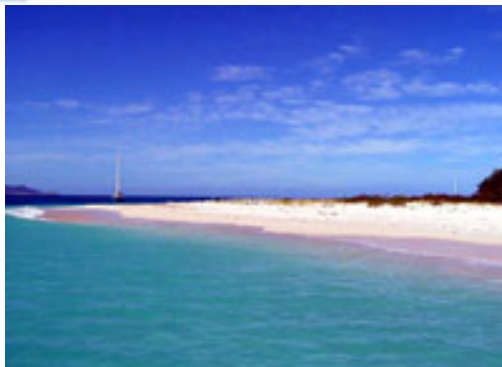
SWIM WITH THE OLYMPIANS!