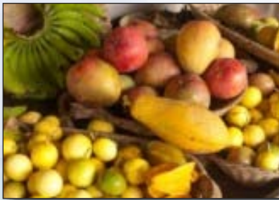
Local tropical fruits.

Formerly known as the Creque Dam Farm, the Ridge to Reef Farm is located on 200 acres of rolling hills on the island's west end. The Virgin Islands