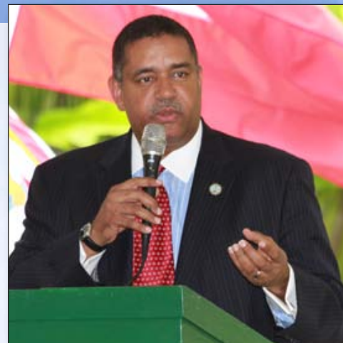
Governor John deJongh, Jr.

"I was always confident that our team would draft a plan to address our initial setbacks [and] meet all requirements necessary to resume the work these four grants were intended to fund," said Governor John deJongh, Jr.