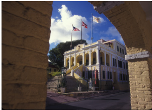
The Government Building, Christiansted

Virgin Islands taxpayers will benefit from a bill that recently was reported out of the Ways and Means Committee of the U.S. House of Representatives and will soon come to a vote on the House floor. Spearheaded by V.I. Delegate to Congress Donna M. Christensen and House Ways and Means Committee Chairman Charles Rangel, it would clarify that Virgin Island taxpayers are entitled to same statute of limitations protections on IRS assessments and collections as U.S. taxpayers. Earlier this year, the IRS asserted it had an unlimited right to audit Virgin Island taxpayers making more than $75,000 a year without regard to any statute of limitations.