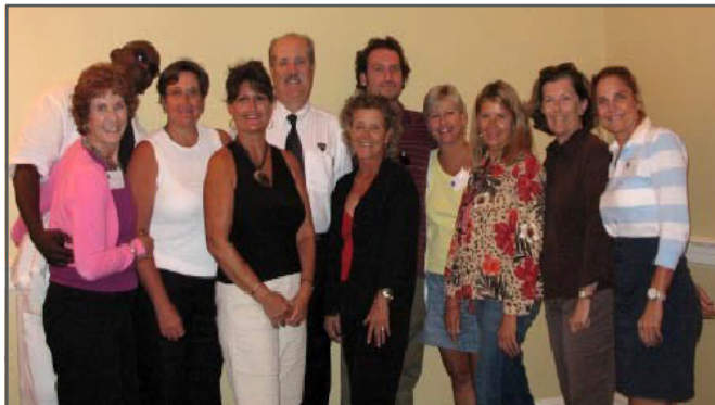
Always looking for a way to learn and advise our clients, agents from Coldwell Banker Land-de Wilde Realty recently participated in a seminar "Creating Wealth through Residential Real Estate Investments".

As a result of the ruling, the V.I. Government has ceased collecting the tax. Not only does the ruling mean that St. Croix consumers can now take advantage of stateside prices without penalty, it also is likely to force on-island retailers to lower their prices on major goods and products because of competitive pricing pressures. Keep in mind, however, it still may be less expensive to purchase automobiles and other household goods on-island — especially if local prices come down — once you factor in shipping charges.