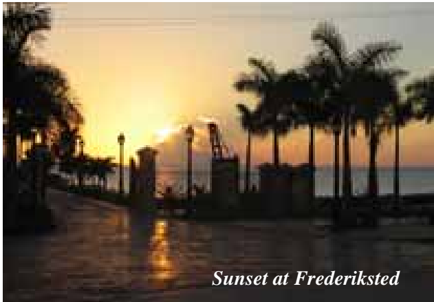
Sunset at Frederiksted

As Virgin Islanders, the sun shines on our spirits 365 days a year. We soak it up; we grow our plants; we warm our souls; and now we can turn it into our electricity.